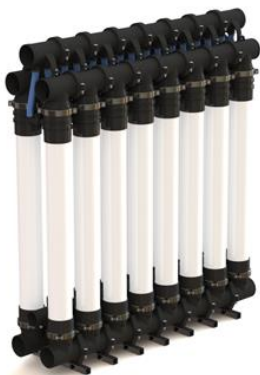
Figure 1: ZW1500-RMS 2x8 configuration

The ZW1500-RMS uses ZeeWeed membrane technology, a membrane that has been proven to meet or exceed regulatory requirements, regardless of source water quality.