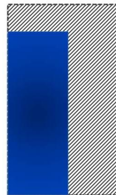
Figure 2: Blue shaded area shows the reduced footprint of the ZW1500-RMS when compared to a typical pressurized UF rack.

NOTE: ZW1500-RMS is not rated for high seismic zones. A seismic kit is available for special acceleration ratings up to 3.0g, upon request.